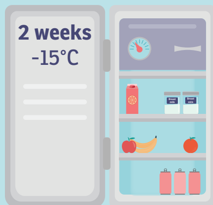
Freezer in fridge