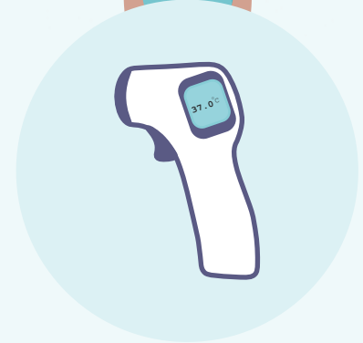
Digital temporal artery thermometer

Ask your doctor, nurse or pharmacist to show you how to use your thermometer properly.