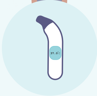
Digital ear thermometer