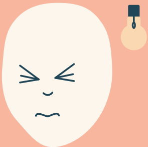
Sensitivity to light