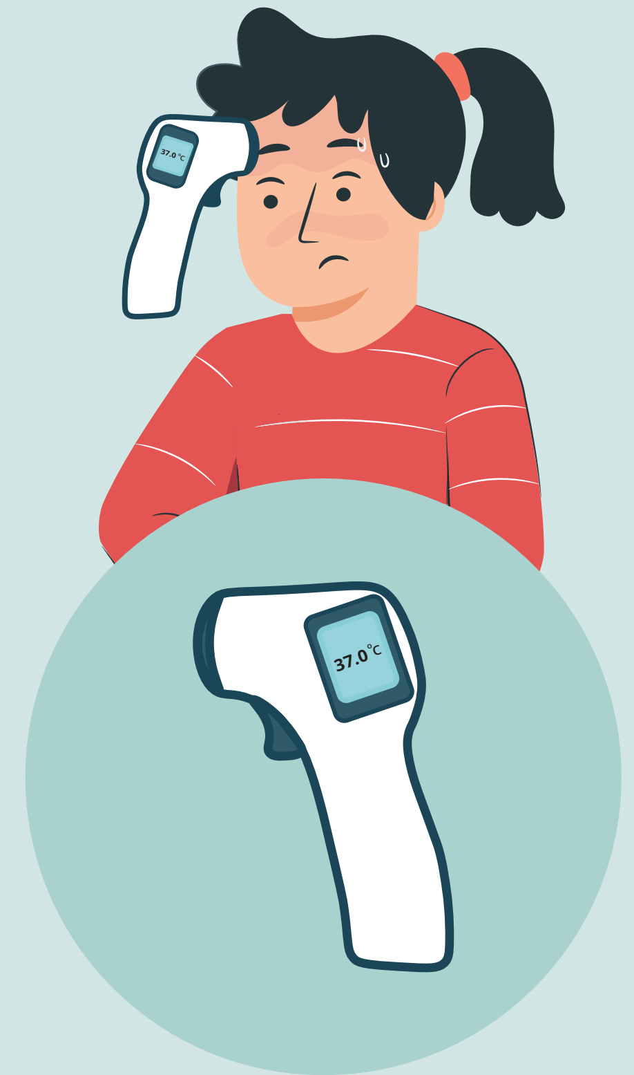
Digital temporal artery thermometer

Ask your doctor, nurse or pharmacist to show you how to use your thermometer properly.