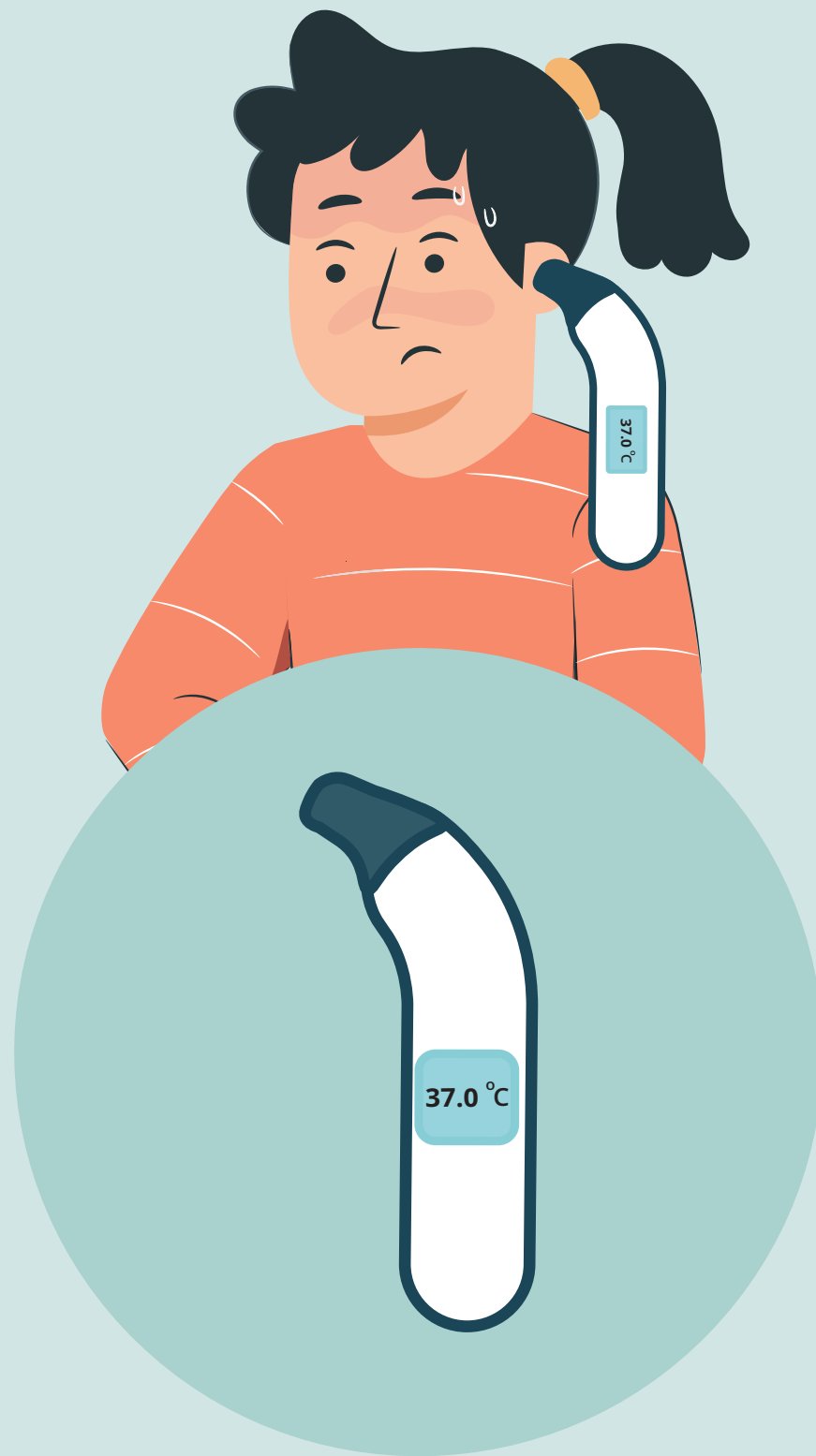
Digital ear thermometer