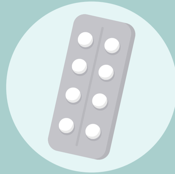
Combined oral contraceptive pill