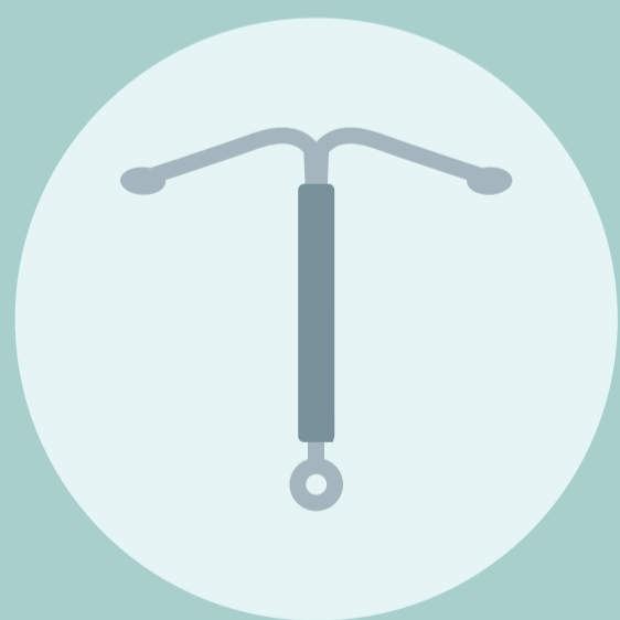
Hormonal intrauterine device (IUD)