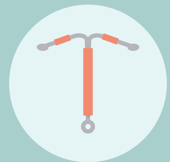
Copper intrauterine device (IUD)